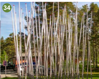
Kari Cavén Skogsdunge, 2002 49 flagpoles 9 x 7,2 x 7,2 m