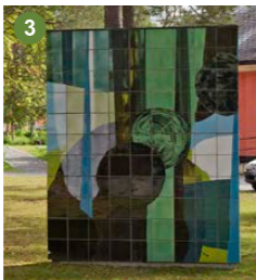
Astrid Sylwan Black, Grey, Broken Sky and Palest Blue, 2010 Ceramic tiles, steel structure 275 x 255 x 40 cm