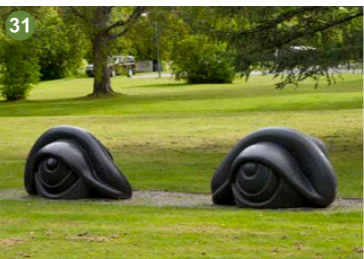
Louise Bourgeois Eye benches II, 1996-1997 Black Zimbabwe granite 122 x 196 x 118 cm