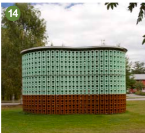
Winter & Hörbelt Kastenhaus 1166, 2000 Metal, wood and PVC