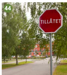
Mikael Richter Tillåtet, 1990–2006 Vinyl on aluminium 62 x 62 cm

“All the activities of the group are characterised by the philosophy that the promotion of good culture leads to a higher quality of life, strengthens the local identity and therefore improves the conditions for the group’s activities. Through investing in sculptural art, for example in Umedalen’s Sculpture Park, Balticgruppen has been instrumental in making Umea a national centre for sculptural art.”