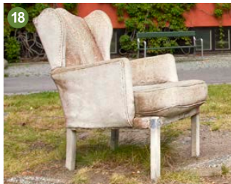
Nina Saunders Hardback, 2000 Concrete 90 x 60 x 100 cm