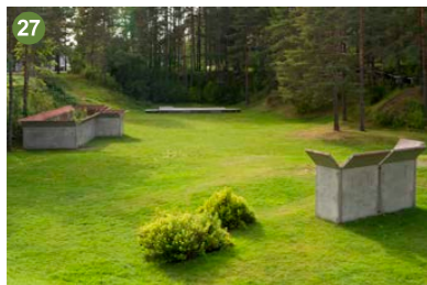
Mirosław Balka Concrete and leaves, 1996 30 x 60 x 10, 250 x 1958 x 795, 30 x 60 x 10, 250 x 521 x 174 cm