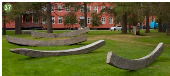
Clas Hake Arch, 1995 Grey granite Each bow between 555–610 cm