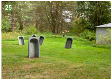
Carina Gunnars Untitled, 1994 Eight galvanized bathtubs