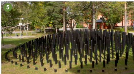
Buky Schwartz Forest Hill, 1997 Plastic pipes, concrete 200 x 1740 x 1740 cm