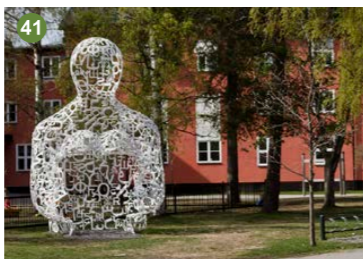
Jaume Plensa Nostros, 2008 Painted steel 500 x 360 x 340 cm