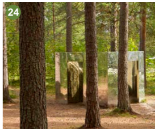
Cristina Iglesias Vegetation Room VII, 2000 13 resin and bronze powder panels 250 x 185 x 220 cm, 275 x 300 cm