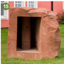
Anish Kapoor Pillar of light, 1991 Sandstone 150 x 140 x 200 cm