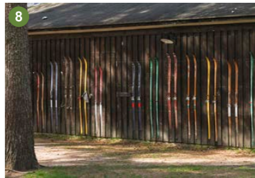
Raffael Reinsberg Social Meeting, 1997 Wooden skis 270 x 2500 cm