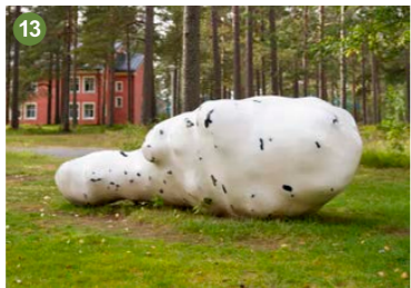
Wilhelm Mundt Trashstone 389, 2008 Production waste in polyester/fiberglass 110 x 303 x 112 cm