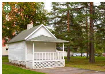
Clay Ketter Homestead, 2004 Wood, stone, cement, paint, lamp 500 x 820 x 390 cm