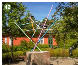
Jacob Dahlgren Den Sjuka Flickan, 2004 Painted Steel 325 x 210 x 300 cm