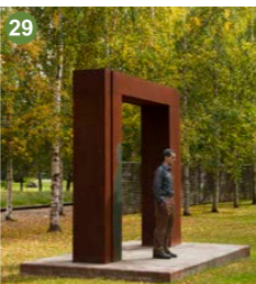
Sean Henry Trajan's Shadow, 2001 Bronze, oil, paint, steel arch 330 x 407 x 64 cm