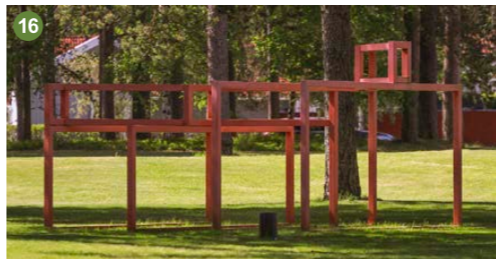
Mats Ljus Flip, 2006 Painted steel 235 x 350 x 370 cm