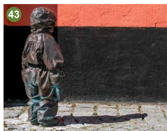
Charlotte Gyllenhammar Out, 2004 Bronze 95 x 42 x 25 cm