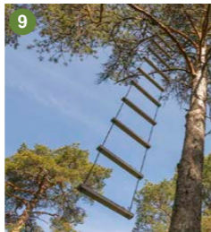
Johanna Ekström Ladder, 1998 Steel wire, aluminium h. 600 cm