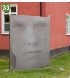
Anne-Karin Furunes Untitled, 2002 Stainless steel 260 x 224 cm