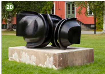
Tony Cragg Stevensson (Early Forms), 1999 Bronze 90 x 144 x 107 cm