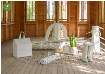
Gunilla Samberg Räddningsplats, 2008 Textile, grass, sunflower seeds 240 x 240 x 90 cm