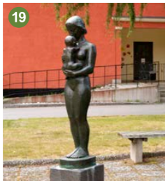
David Wretling Mor och barn, 1958 Bronze 115 x 25 x 30 cm