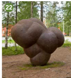
Antony Gormley Still Running, 1990-93 Cast iron 276 x 317 x 148 cm