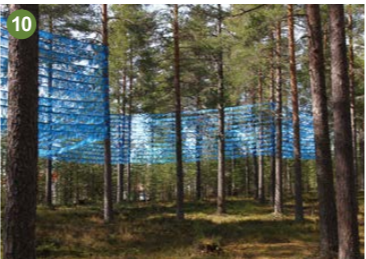
The Art Guys Love Song for Umeå, Banner work #7, 2002 Metallic polyurethane plastic banners