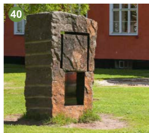
Takashi Naraha Structure 88-J-1, 1998 Green ekeröd granite 194 x 116 x 71 cm