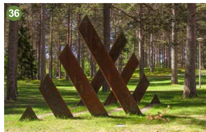
Bernard Kirschenbaum Untitled, 1993 Steel 277 x 315 x 315 cm