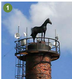
Lin Peng A New Perspective, 2004 Mixed media, sound installation h 3900 cm