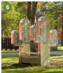
Jonas Kjellgren The most lonesome story ever told, 1998 Stainless steel 150 x 130 x 85 cm