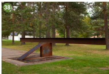
Cristos Gianakos Beam Walk, 1996 Steel 140 x 1000 x 300 cm