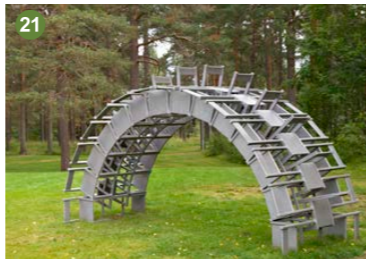
Kari Cavén Klassresa, 2008 Aluminium 225 x 154 x 378 cm