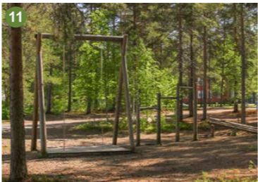
Torgny Nilsson Dysfunctional Outdoor Gym, 2004 Wood, metal, rope h. 4500 cm