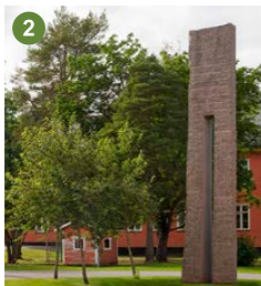
Bård Breivik Untitled, 2001 3 Granite works, h900cm