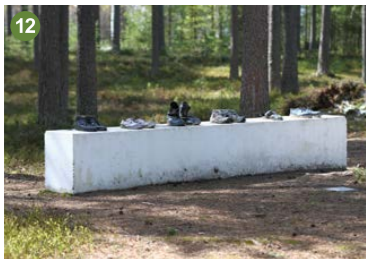
Roland Persson Untitled, 1998 Painted bronze, concrete 80 x 45 x 358 cm