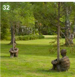
Jaume Plensa Heart of Trees, 2007 Bronze and trees 99 x 66 x 99 cm