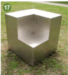
Cristos Gianakos Double Cross, 1999 Stainless steel 2 x (95 x 95 x 95 cm)